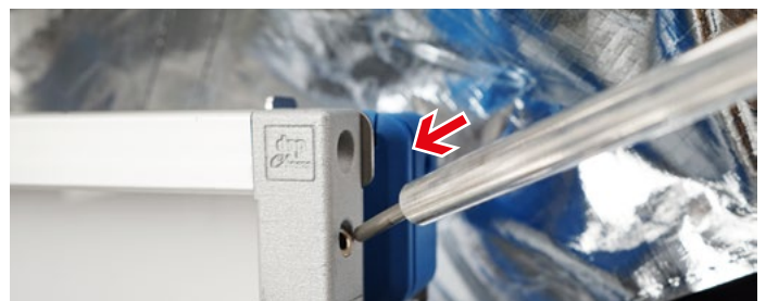
4.) Push in the 2 upper rods first to the RABBIT-EARS® – continue with all other rods.