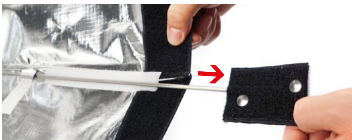
3.) Release the Velcro® strips.