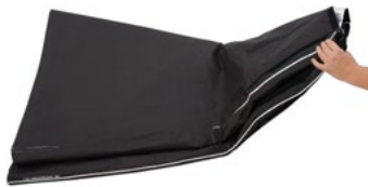
1.) Unpack and unfold the SNAPBAG® OCTA.

L2.0016159 / SBAR05 L2.0016165 / SBAR07 L2.0016163 / SRADB05 L2.0016160 / SRADB07